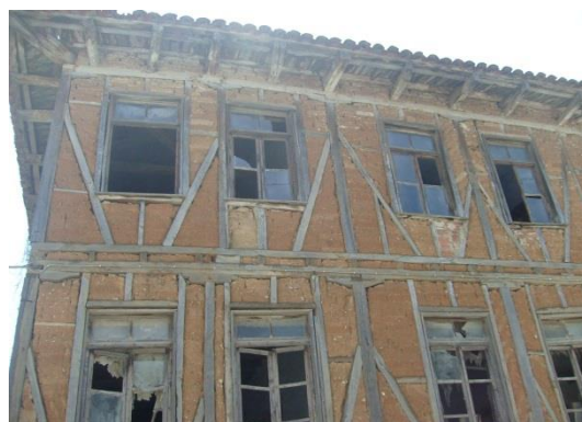
Fig. 3. Wooden beams and conjunctions of earth-block structure

Up to date there is no policy for their retrofitting, maintenance and upgrading, since the tradition of constructing earth masonry has vanished and there is lack of relevant regulations. As a result, earth-block houses have been abandoned and destroyed due to damages from earthquakes, ageing or unsuitable interventions (use of concrete members, cement based mortars), while many settlements with earth houses have been marginalized and abandoned. Meanwhile, modern engineers are not accustomed to this type of buildings and there is lack of scientific knowledge and experience in repairing and upgrading them.