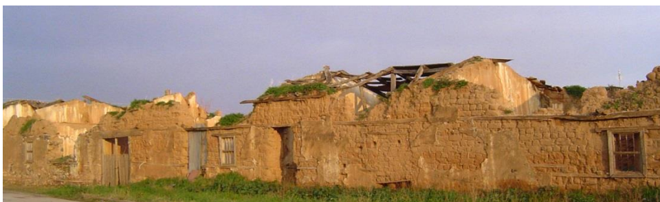
Fig. 4. In situ, macroscopic and microscopic figures of a traditional earth blocks

Research focused on the analysis of the building materials from a settlement of historic earth-block structures (Kolligospita, Zografou settlement), located in Chalkidiki peninsula, N. Greece and dated in 1845(Fig.4). The settlement is nowadays abandoned, while earth-block structures confront severe damages [6].