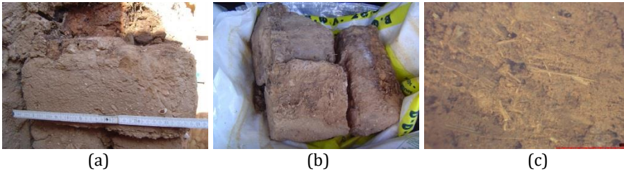
Fig. 5. In situ, macroscopic and microscopic figures of a traditional earth blocks

and material detachments). Porosity was around 10% and apparent specific gravity 1.7. As expected, their water absorption and capillary sanction were high and led to material detachments.