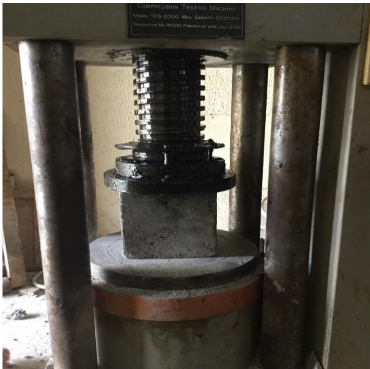
Fig. 1 Test sample in the compression testing machine

Compressive strength of the hardened concrete was determined after curing period of 7, 14, and 21 days. Compressive strength of the developed SCC was determined according to ASTM C39 [25] by means of a compression testing machine (Model YES-2000, England) shown in Figure 1. The dimension of the cube was 150 mm in length, breadth and height. The sample was placed on the machine in proper order. Care was taken to ensure the idle was on the base plate. The load was increased at 140 \text{ kg/cm}^2 until failure. The highest load was observed and recorded.