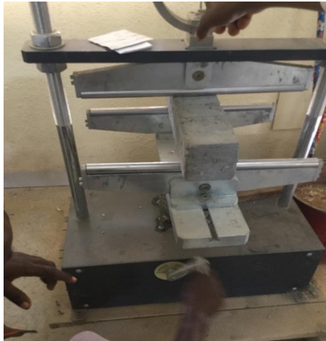
Fig. 2 Three-point bending test

Employing 0.10 mm and 0.38 mm leaf-type sensor gauges, care was taken to avoid spaces between the samples. Any hole more than 0.10 mm was eliminated utilizing calfskin shims (6.4 mm thick and 25 to 50 mm long). Capping or pounding were considered to evacuate holes in abundance of 0.38 mm. The sample was loaded consistently without stun till failure was achieved. Indian standard determined stacking rate of 400 kg/min for 150 mm sample and 180 kg/min for 100 mm sample was used at a stress increment rate 0.06 \pm 0.04 \text{ N/mm}^2 \cdot \text{s} as per British standard.